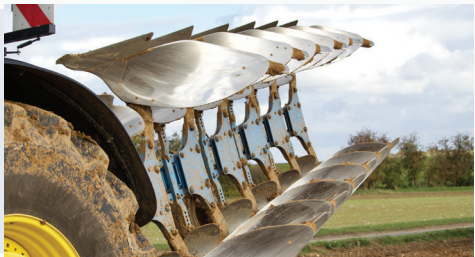
HYDRAULIC REVERSIBLE PLOUGH