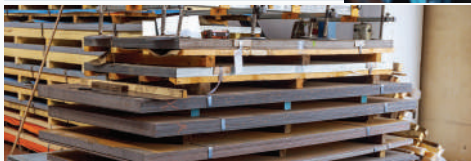
VALUE ADDED SHEETS & PLATES