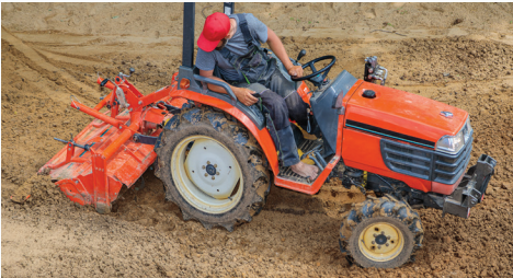
TRACTOR LAND LEVELERS