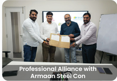
Professional Alliance with Armaan Steel Con