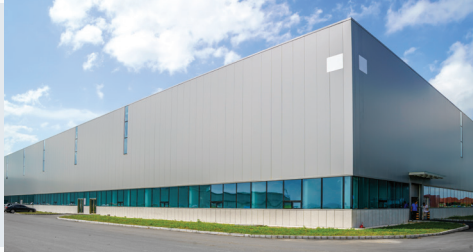
INDUSTRIAL PEB BUILDING