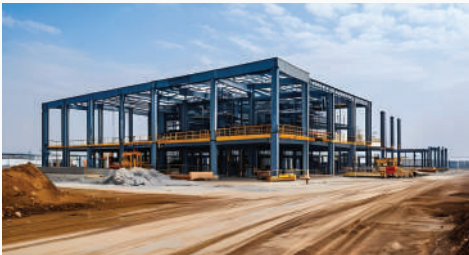
COMMERCIAL PEB BUILDING