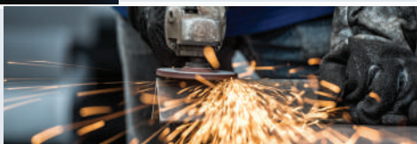
CUSTOMIZED STEEL SOLUTIONS