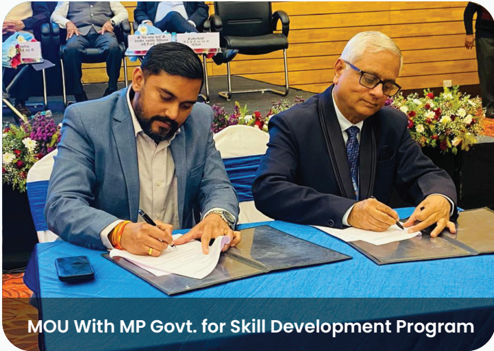
MOU With MP Govt. for Skill Development Program