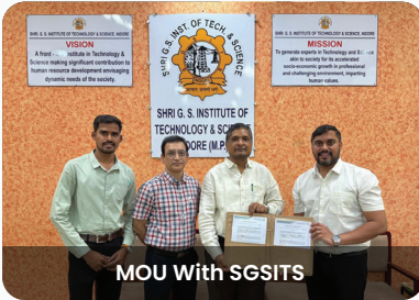
MOU With SGITS

These are the patrons who have shown their faith & trust in our undertakings