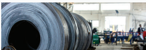
HOT ROLLED COILS